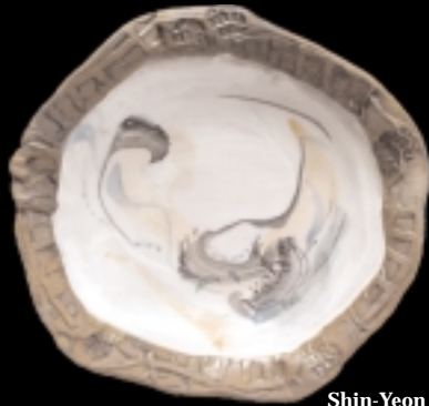
Shin-Yeon Jeon Form and Color

in Celebration of 100 Years of Korean Immigration 1903 - 2003